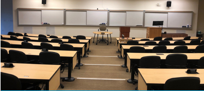
1213 - Seats 76