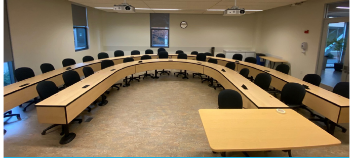
1302 - Seats 34