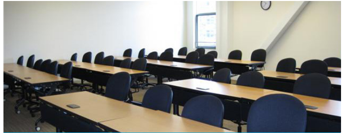
2310 - Seats 48