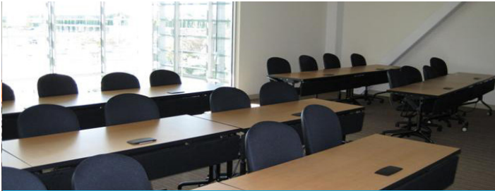
2102 - Seats 28